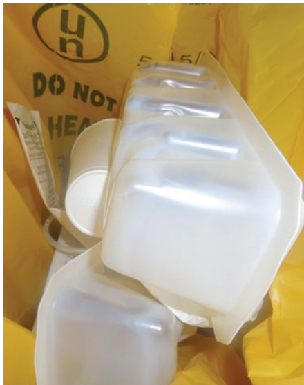
An example of clean composite packaging in a clinical risk waste bin